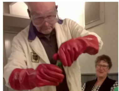
29 Minute Talks